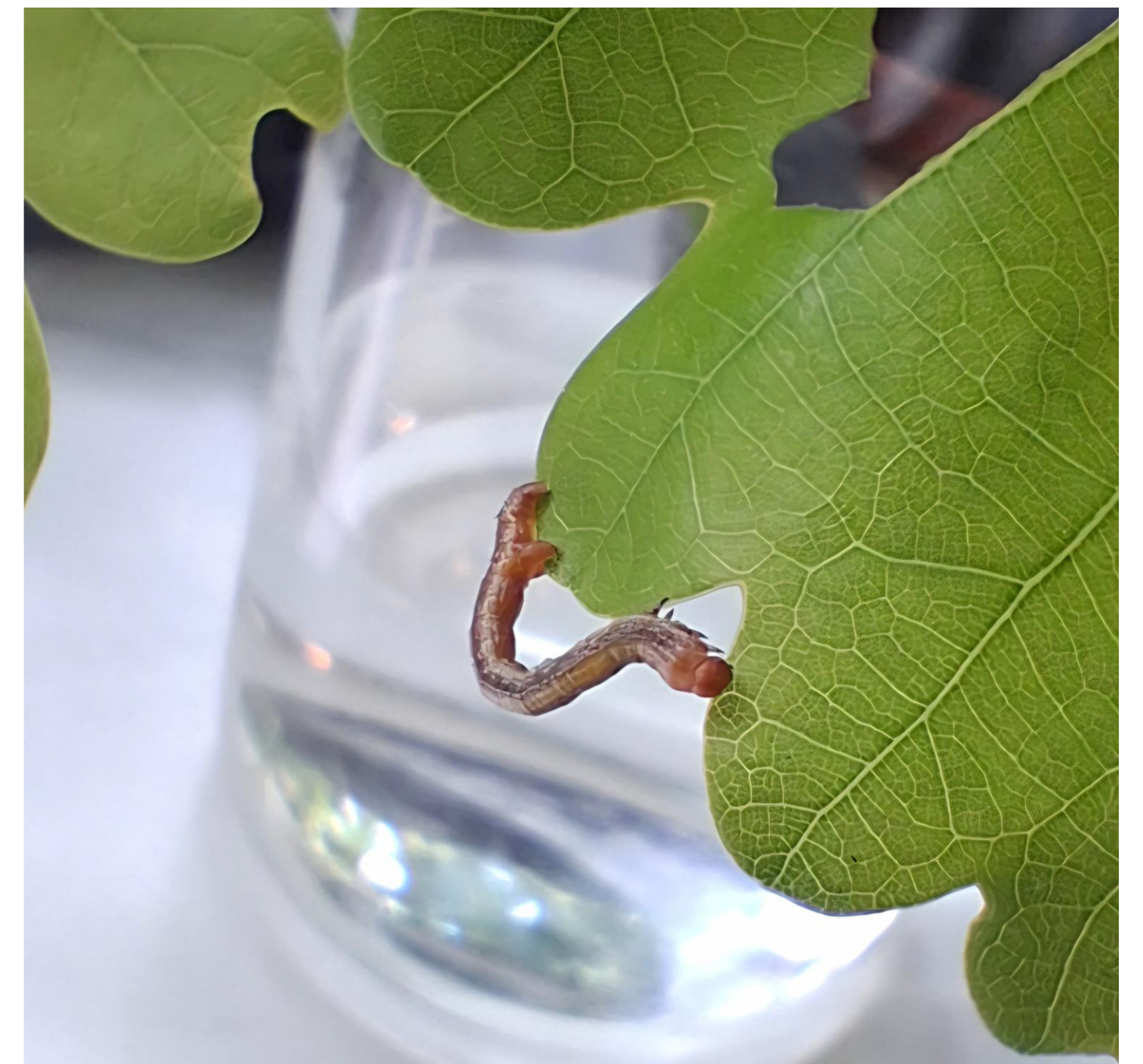
Figure 1. Geometridae larva feeding on Quercus robur .