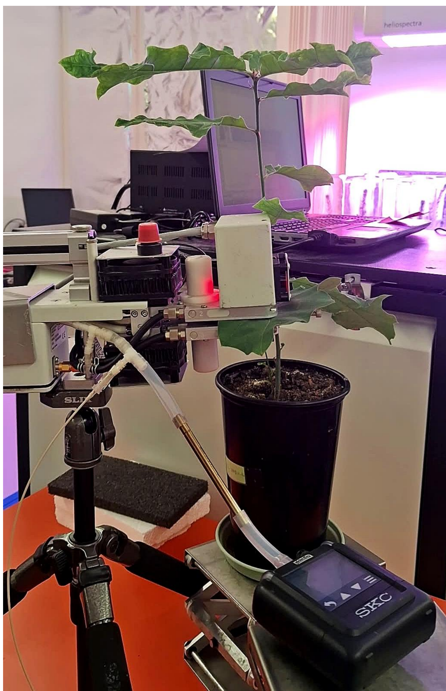
Figure 3. Quercus rubra leaf in a Walz GFS-3000 chamber configured for simultaneous PTR-TOF-MS real-time tracking and synchronous GC-MS data sampling.

By synchronizing leaf wounding and detection within a stable gas-exchange environment, the within-chamber protocol overcomes conventional VOC measurement limitations, directly capturing rapid wound-induced volatile dynamics while providing a framework for plant stress and plant-atmosphere research.